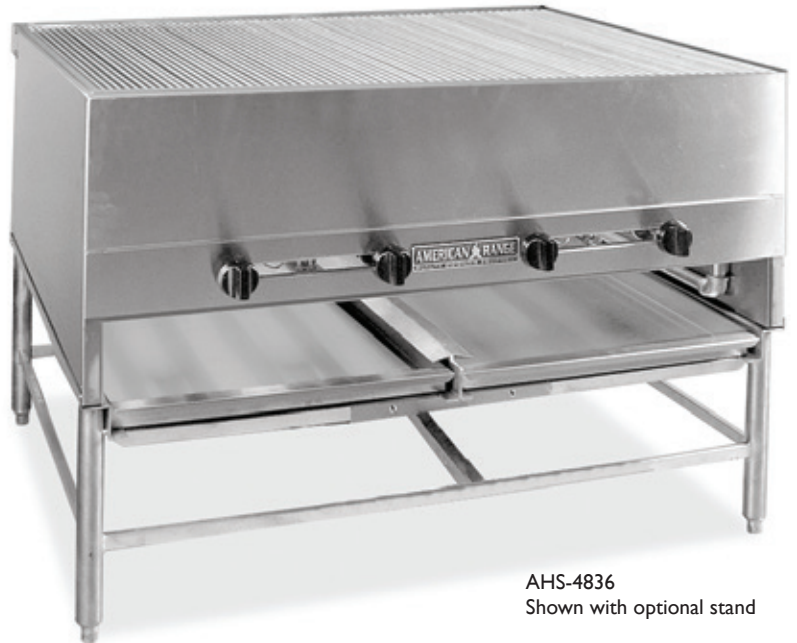
AHS-4836 Shown with optional stand